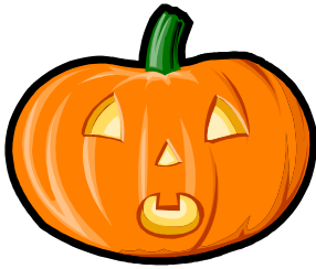
Table 2 - The Great Pumpkin