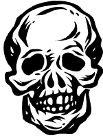
Table 3 - Monster Mash